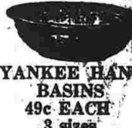
YANKEE HAND BASINS 49c EACH 3 sizes